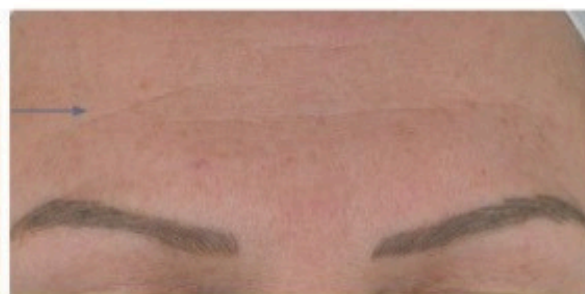
AFTER 4 WEEKS

*Based on a perception study of 32 participants using the DermResults Advanced 5-Step Regimen twice daily.